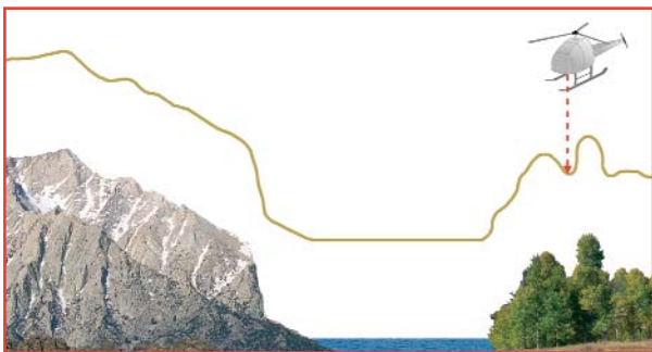
Representation of typical data output using Optech's Laser Altimeter for profiling, autoland and height of flight measurements. Using first and last pulse technology, the Laser Altimeter can identify both forest canopy and forest floor.