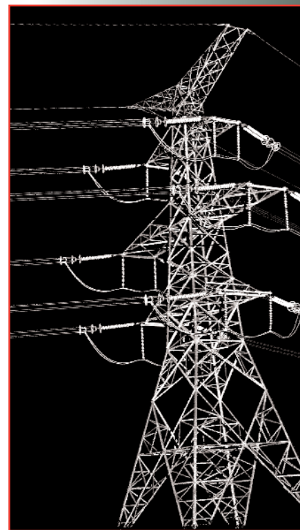
Above image: Point cloud image of power lines and support tower, scanned with ILRIS-3D laser imaging system.